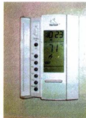
Here's a typical thermostat in a bathroom with in-floor electric radiant heating.

We have introduced radiant heat as part of electric heating in this discussion. Electric heat is, for the most part, relatively straightforward to inspect. The big issues are electrical safety and adequacy of heat. More information can be found in the ASHI@HOME training program ■