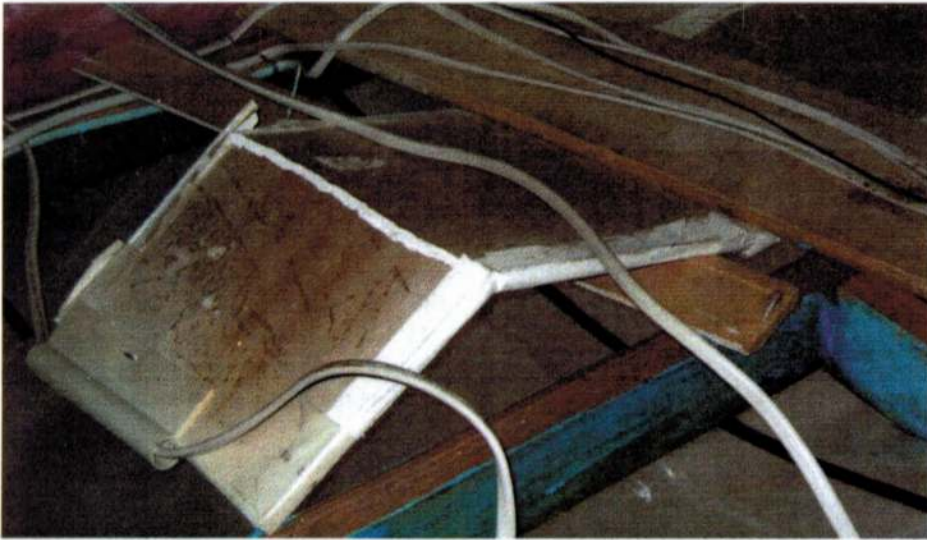
A pre-wired ceiling panel that has cracked as a result of a person stepping on it in the attic.

air space below. Heat trapped between the floor and insulation radiates through the floor to the room above.